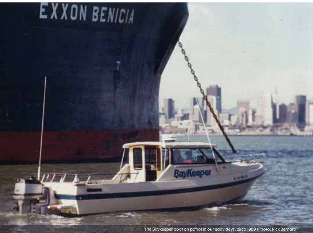
The Baykeeper boat on patrol in our early days, circa 1989

ignoring environmental laws to store mothballed military ships on the Bay, where toxic paint and chemicals leached off the ships