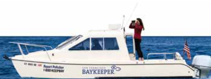
Photo of Baykeeper boat